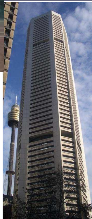
Sydney MLC Building