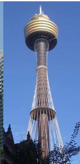
Sydney Centre Point Tower