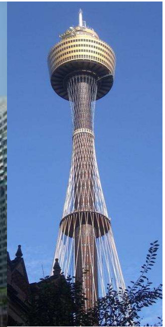
Sydney Centre Point Tower