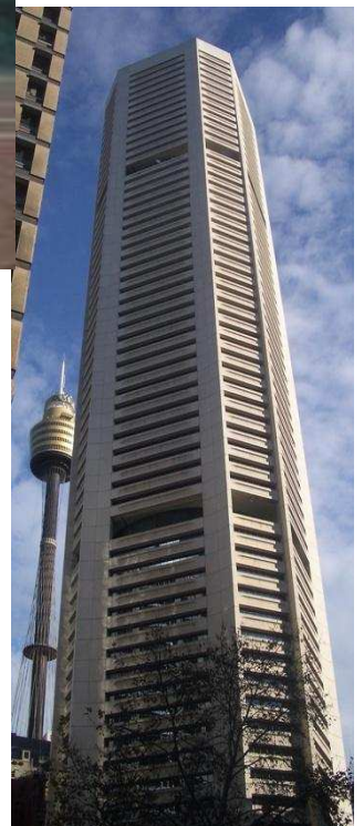
Sydney MLC Building